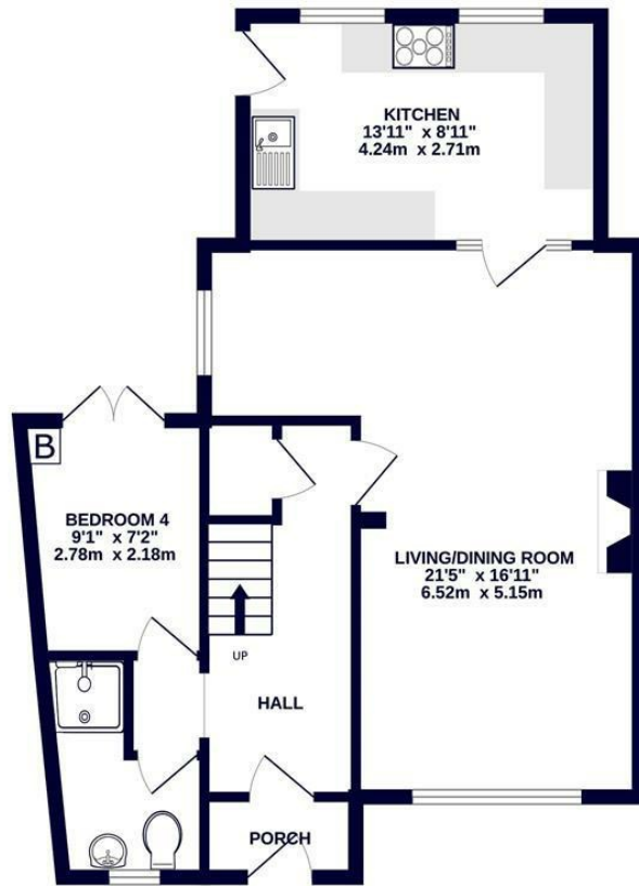
GROUND FLOOR 610 sq.ft. (56.6 sq.m.) approx.