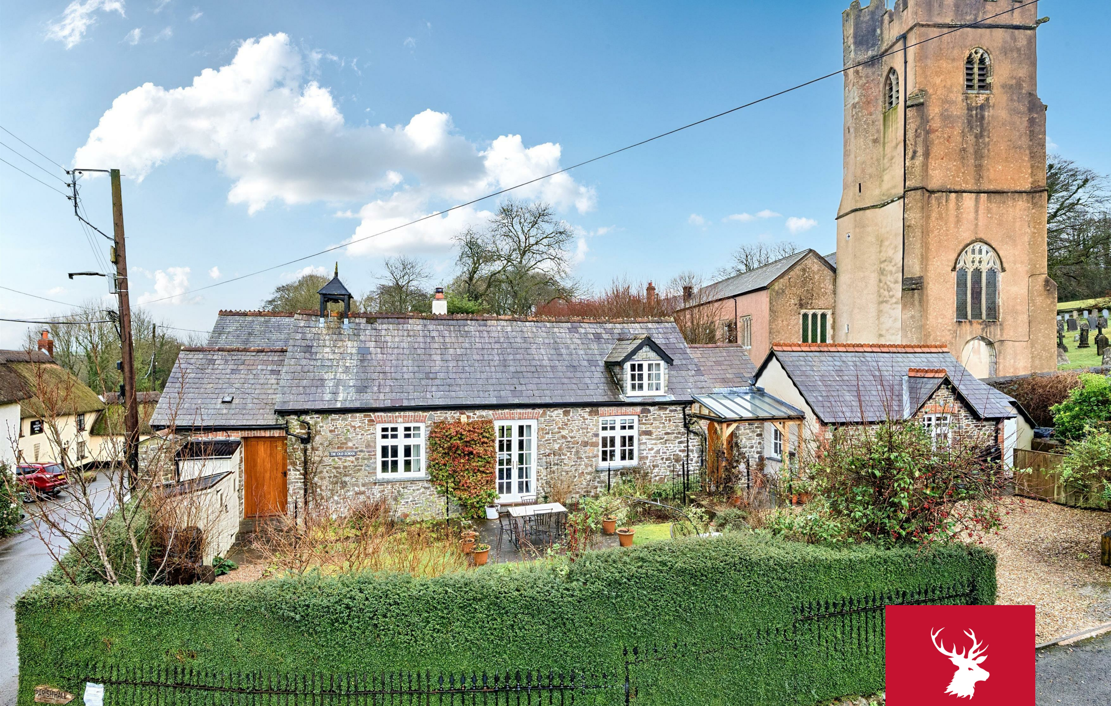
The Old School House