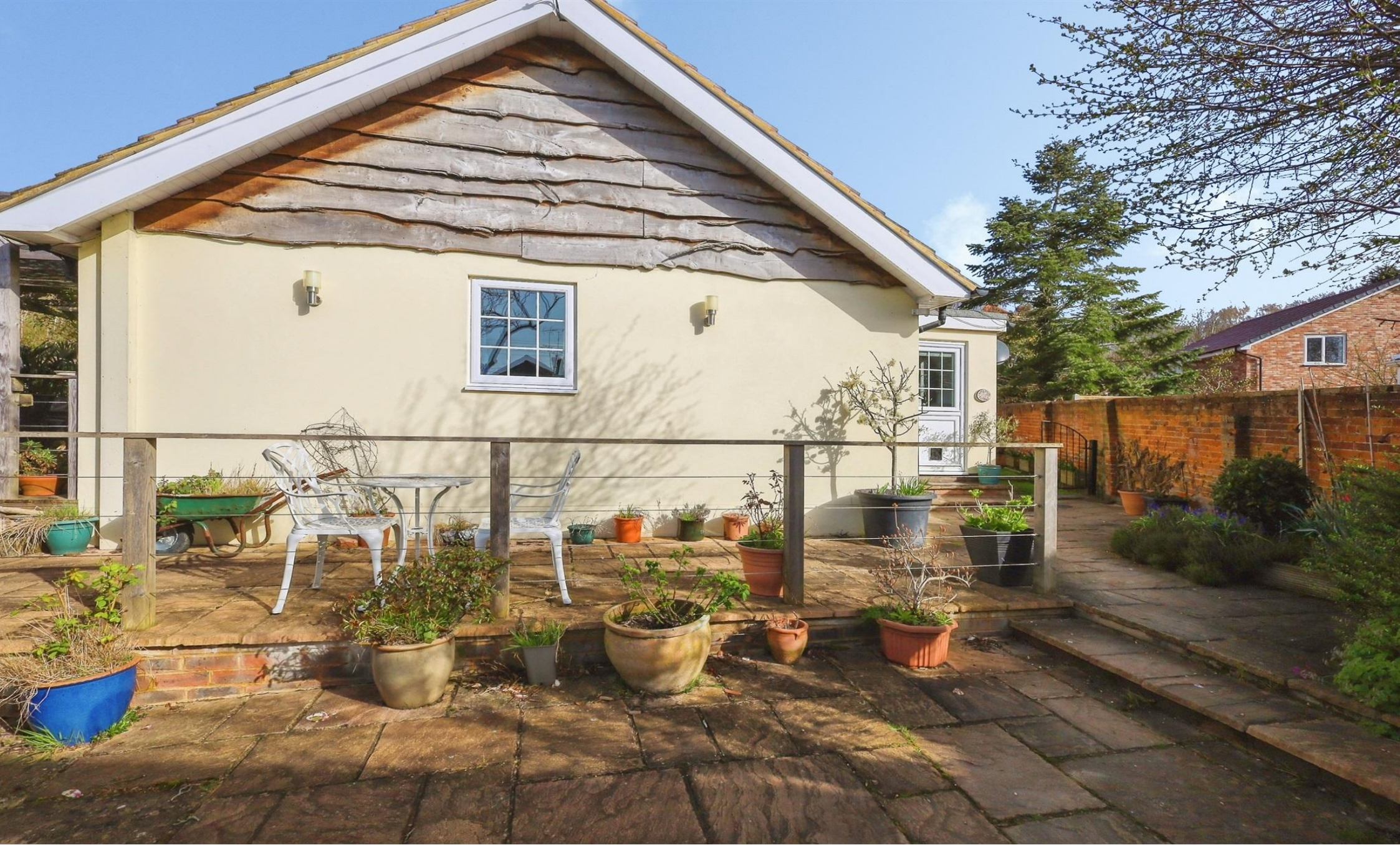
Kilnwood Lane, South Chailey, Lewes BN8 4AU