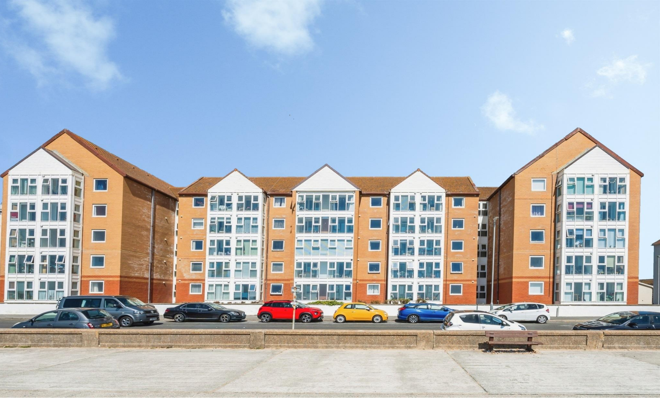
Stratheden Court Esplanade, Seaford BN25 1JP