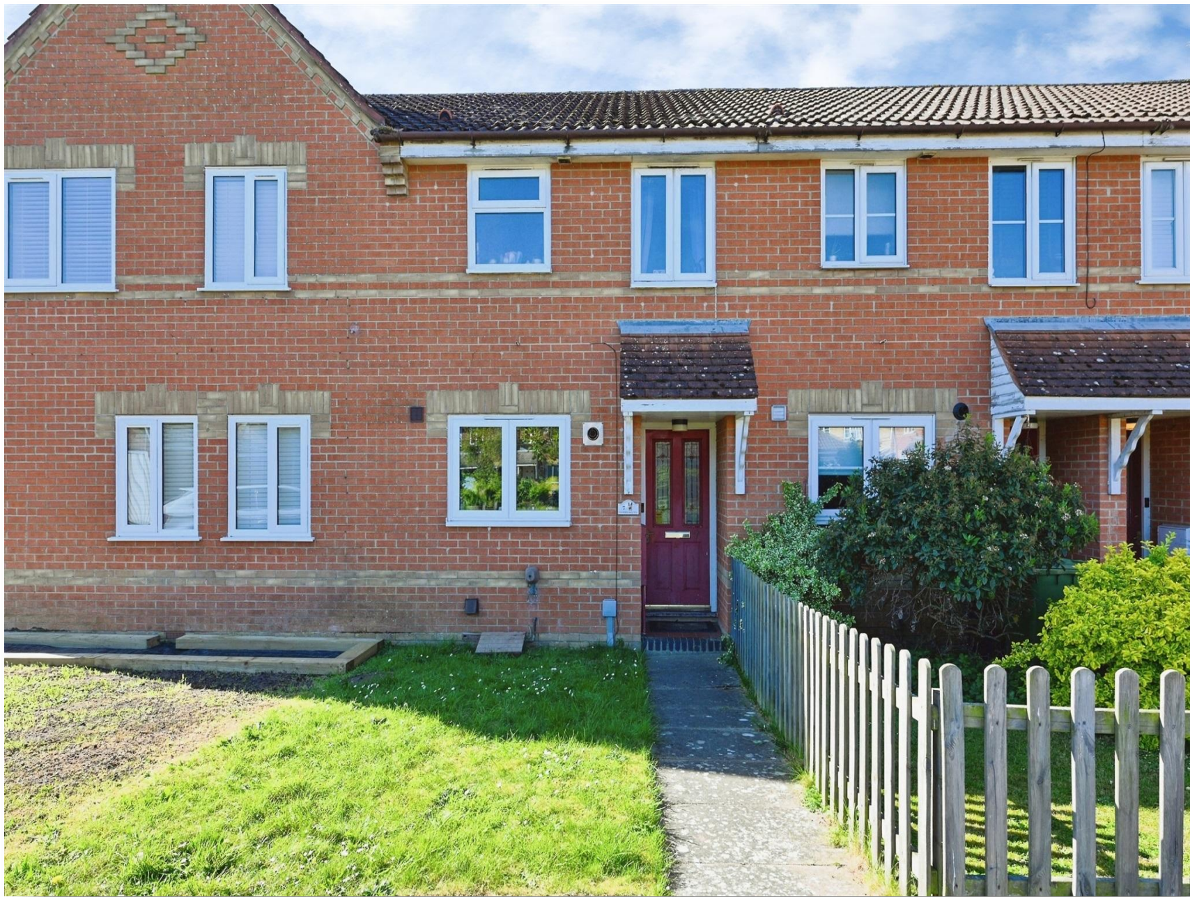
Woodbridge Way, King's Lynn, PE30 4YW