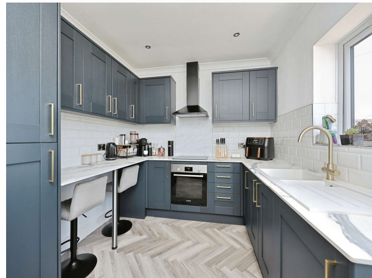
Rolleston, Occupation Road, Mattishall, Dereham, NR20 3QY