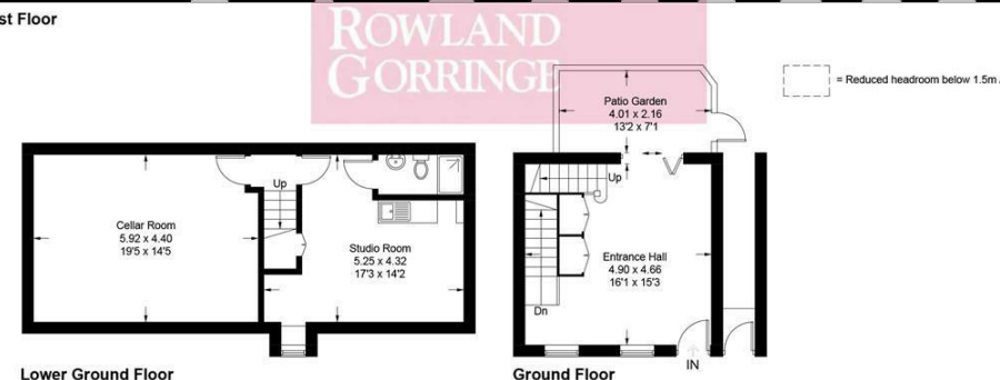
Illustration for identification purposes only, measurements are approximate, not to scale. Imageplansurveys @ 2026