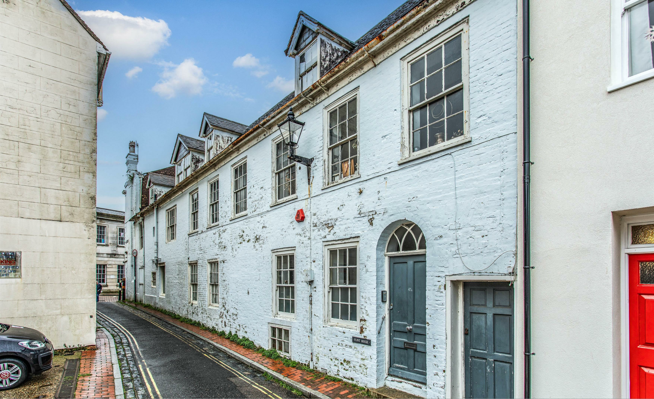
Flint House, 41A High Street, Lewes, BN7 2LU