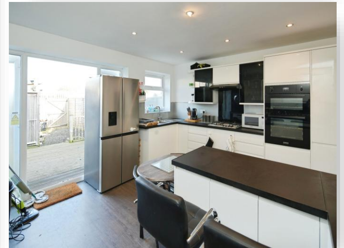
Orient Road, Lancing BN15 8JY