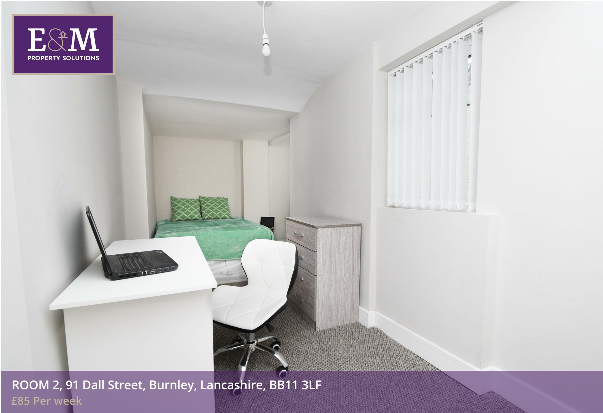
ROOM 2, 91 Dall Street, Burnley, Lancashire, BB11 3LF £85 Per week