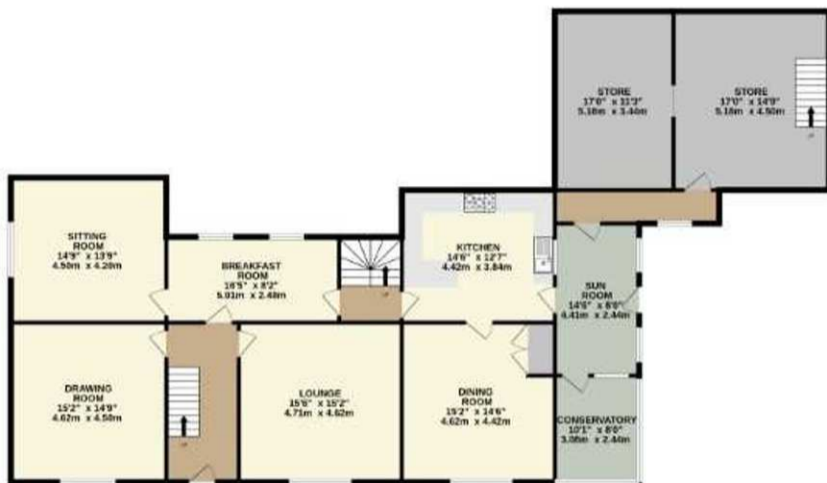
GROUND FLOOR 2040 sq.ft. (189.6 sq.m.) approx.