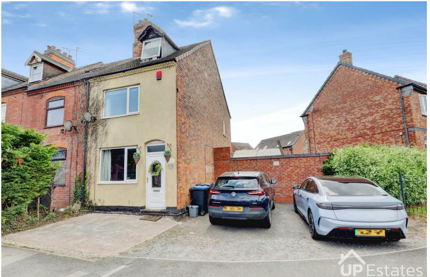
Rugby Road, Burbage