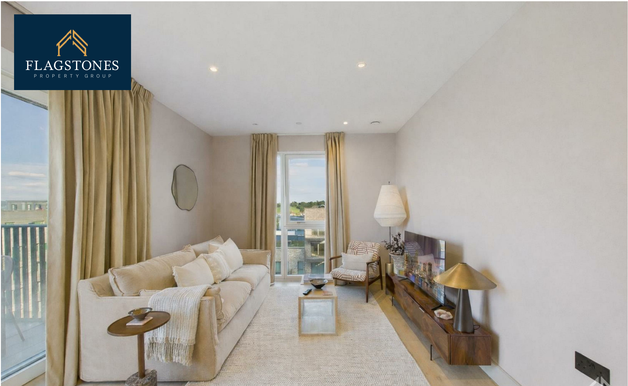
876556 Draycote House, Colindale, NW9 5QF £2,170