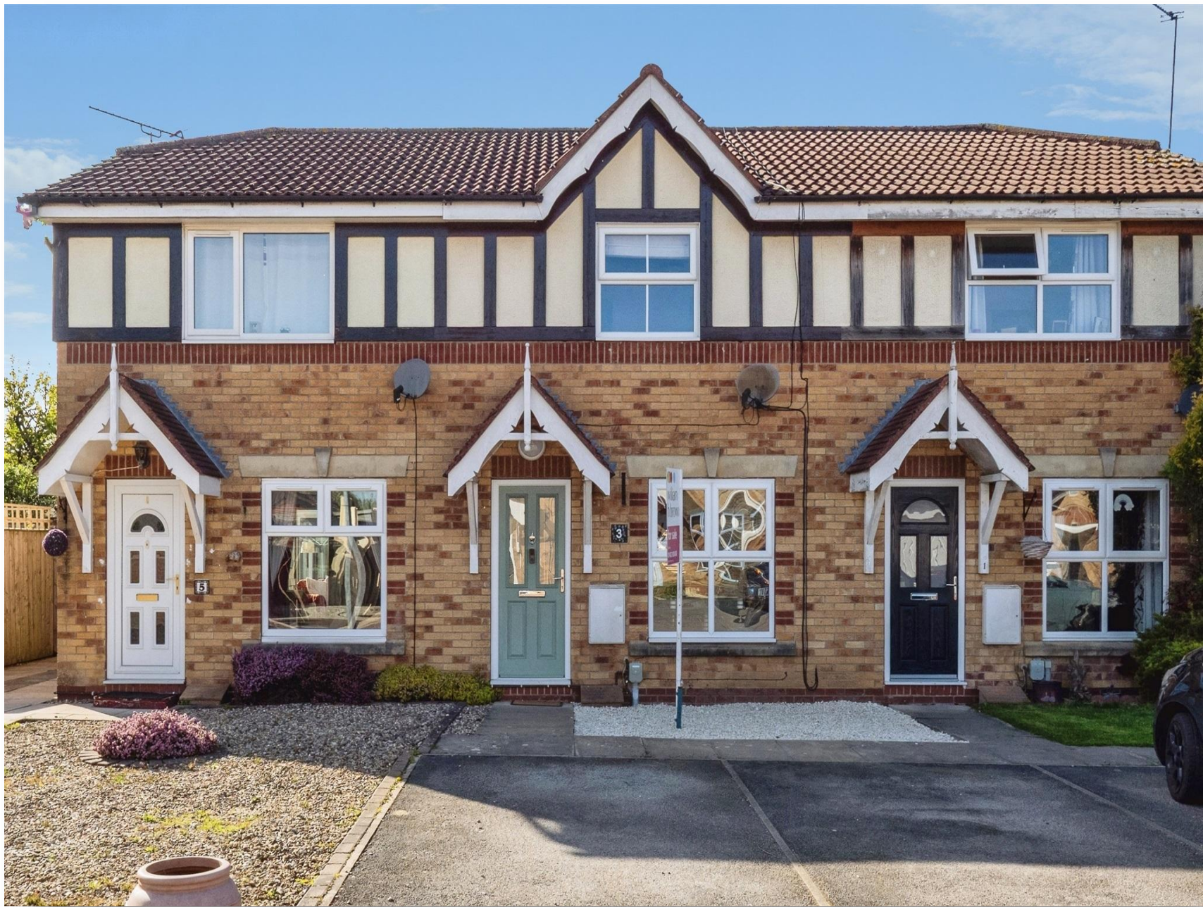
Johnston Court, BEVERLEY, HU17 9GF