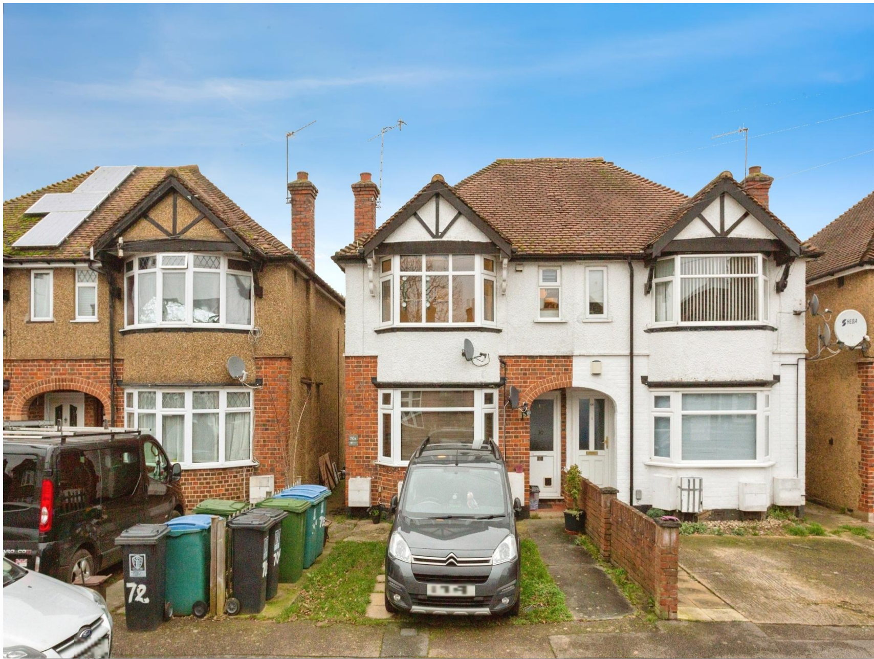
Maytree Crescent, Watford, WD24 5NW