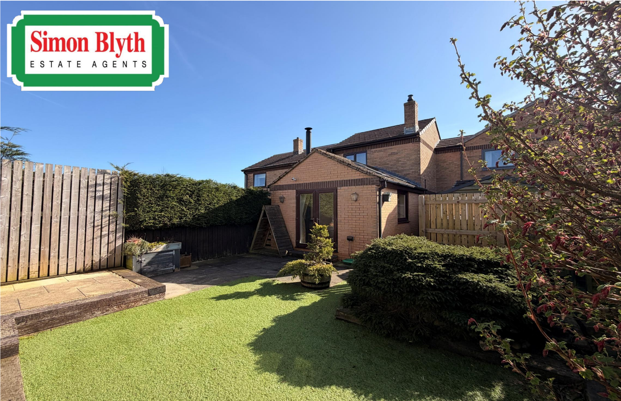
NEW SMITHY DRIVE, THURLSTONE, SHEFFIELD