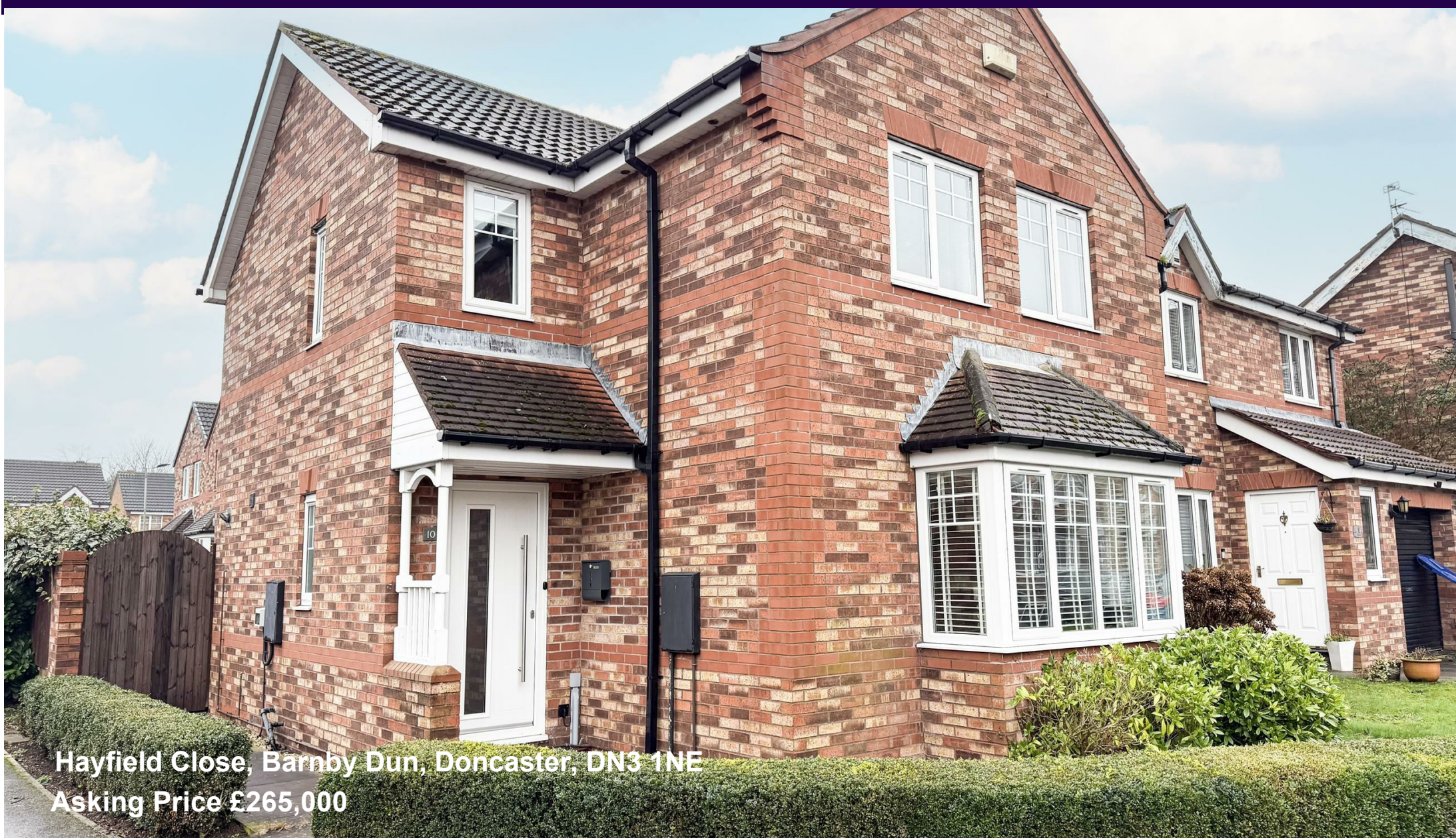
Hayfield Close, Barnby Dun, Doncaster, DN3 1NE Asking Price £265,000