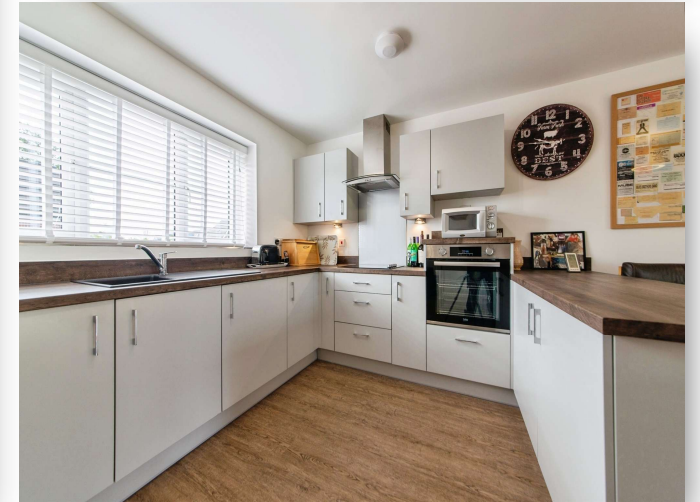
Hotchkin Gardens, Woodhall Spa LN10 6AQ