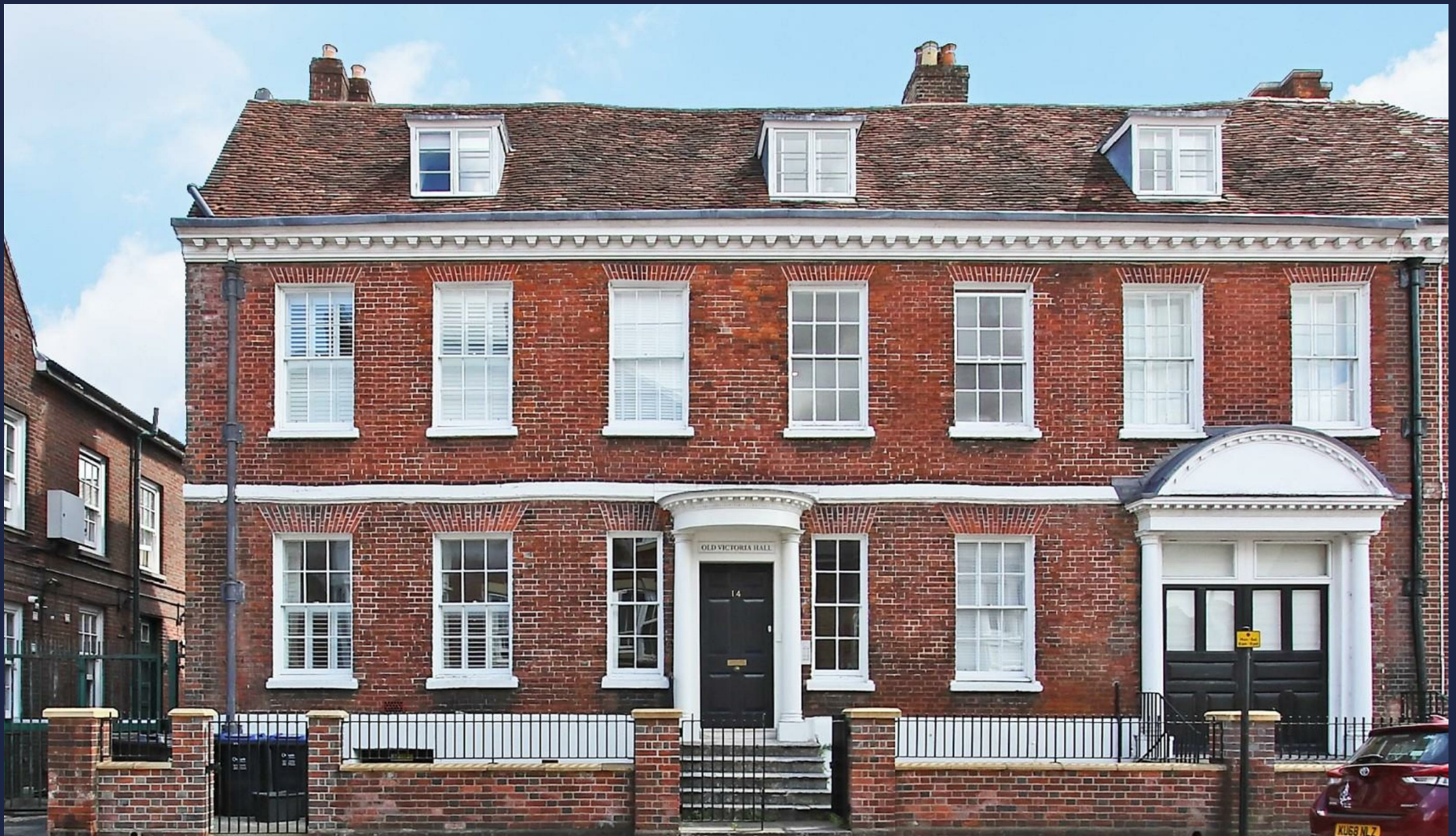
Old Victoria Hall, 14 Rollestone Street, Salisbury