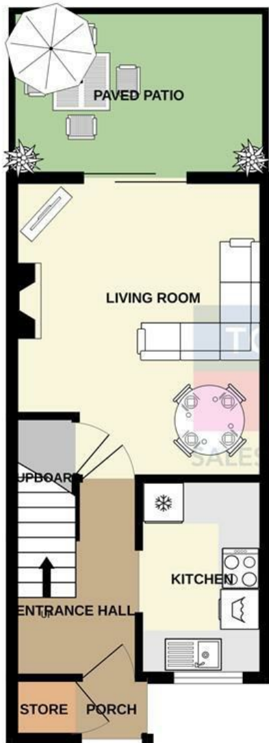
GROUND FLOOR 307 sq.ft. (28.5 sq.m.) approx.