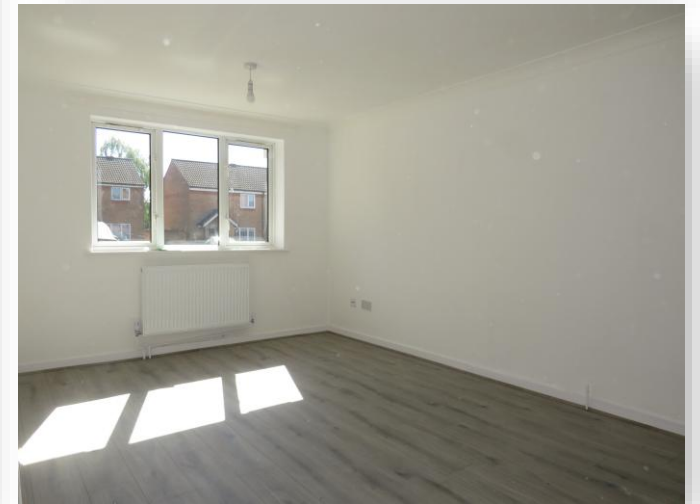
Bowness, Wellingborough NN8 3FS