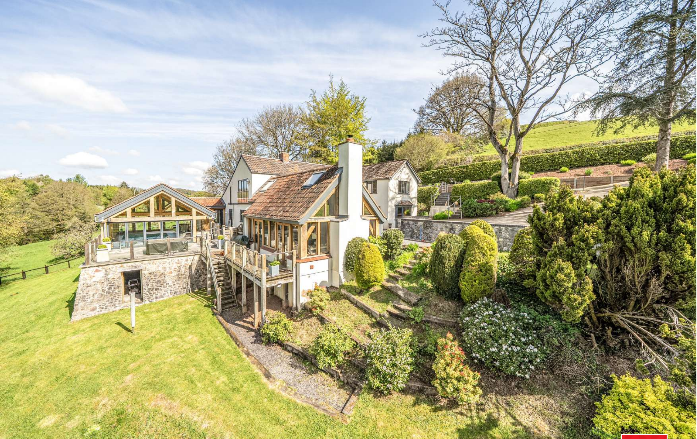
The Woods Lower Merridge TA5 1DT