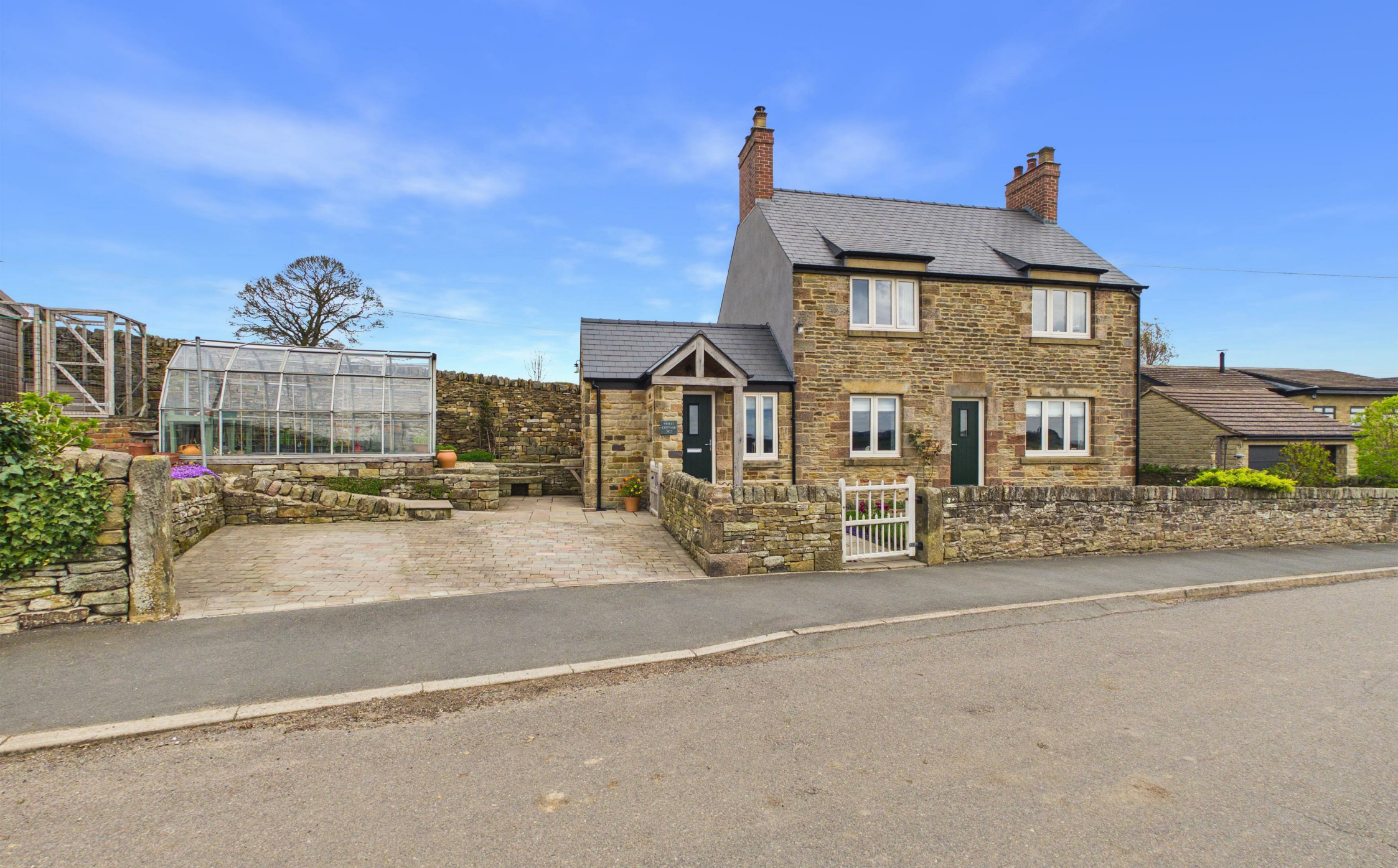
Violet Cottage Newgate, Barlow, S18 7TF