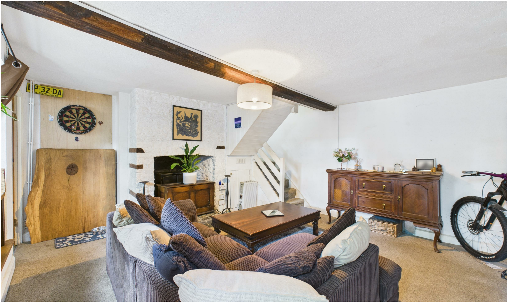
CIRENCESTER LETTINGS | 6 THE WOOL MARKET, CIRENCESTER, GLOUCESTERSHIRE, GL7 2PR