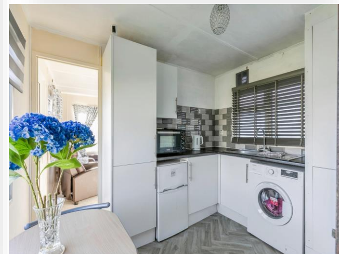
The Paddocks Ramsey Road, Warboys Huntingdon PE28 2RR