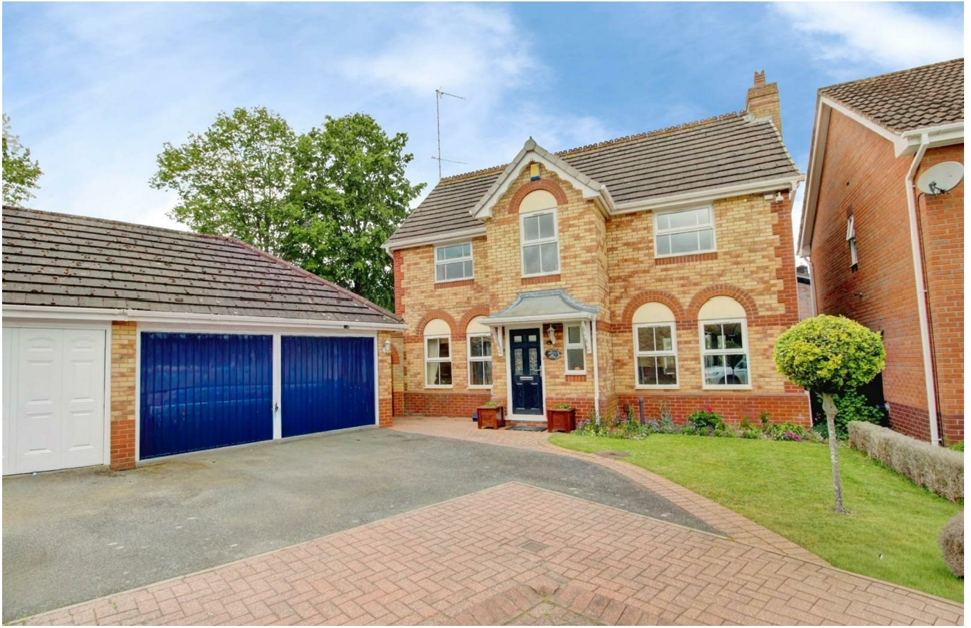
Kelway, Binley, Coventry