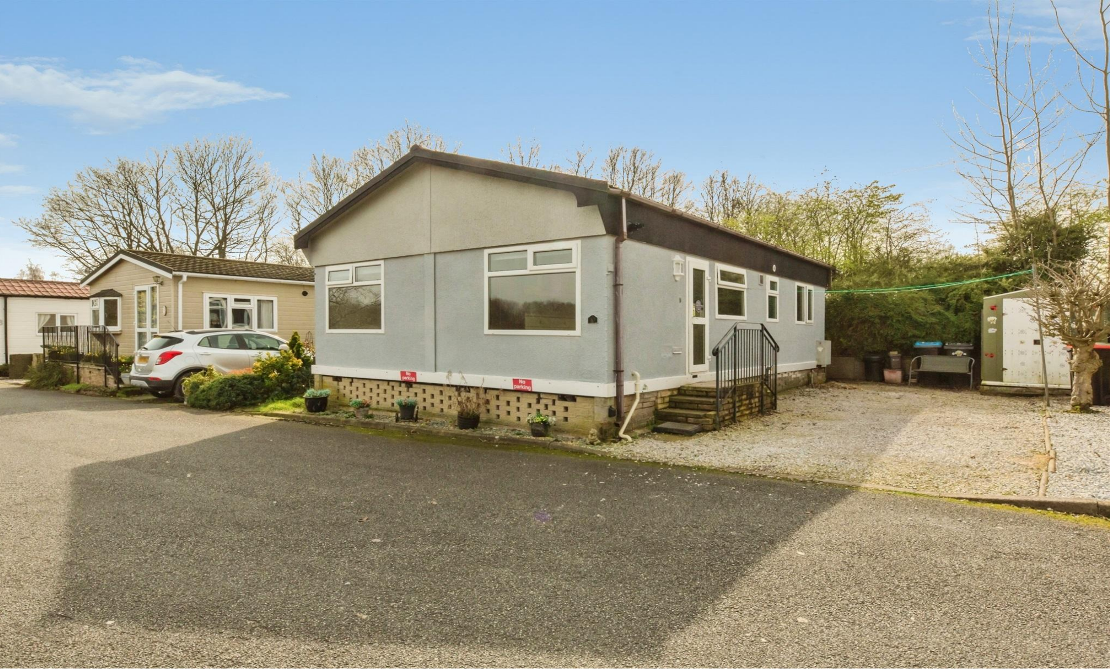
Riverside Park Mill Lane, Meadowbank Winsford CW7 2PN