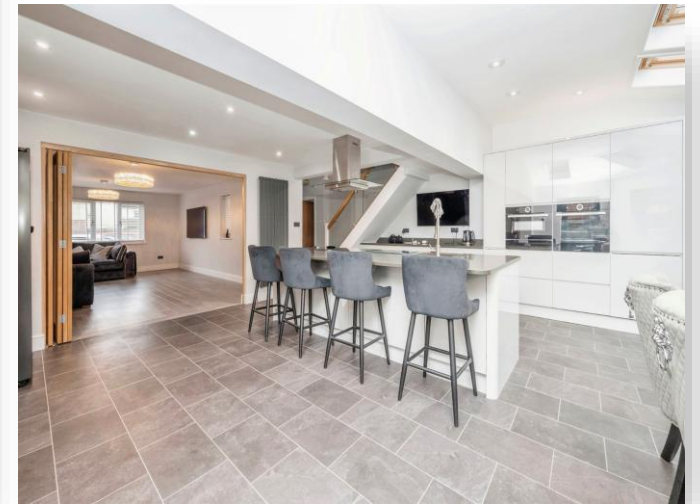
Church Green, Norwich NR7 8BA