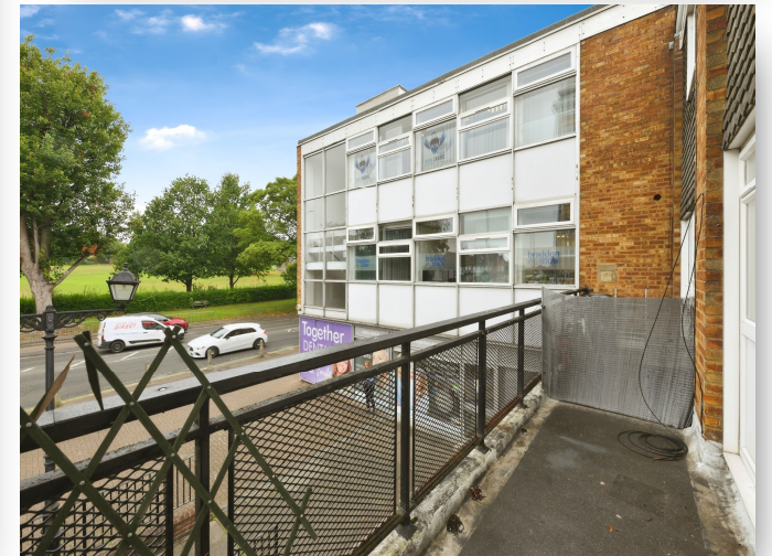
The Precinct, Broxbourne EN10 7HY