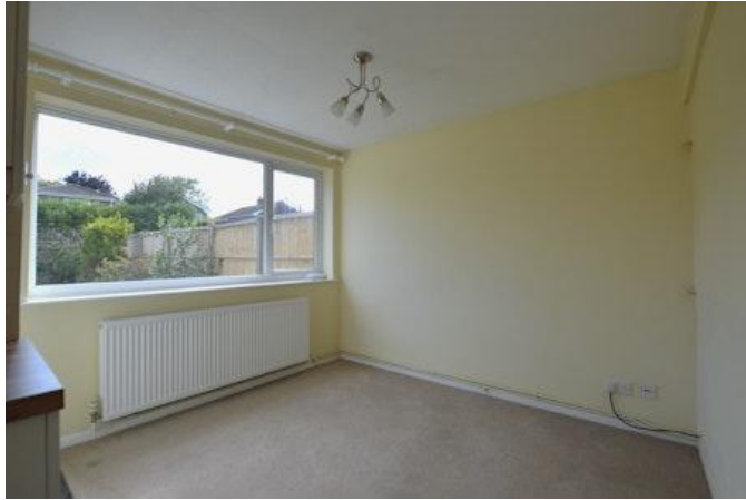
Entrance Hall 1.93m x 4.24m (6'4" x 13'11")