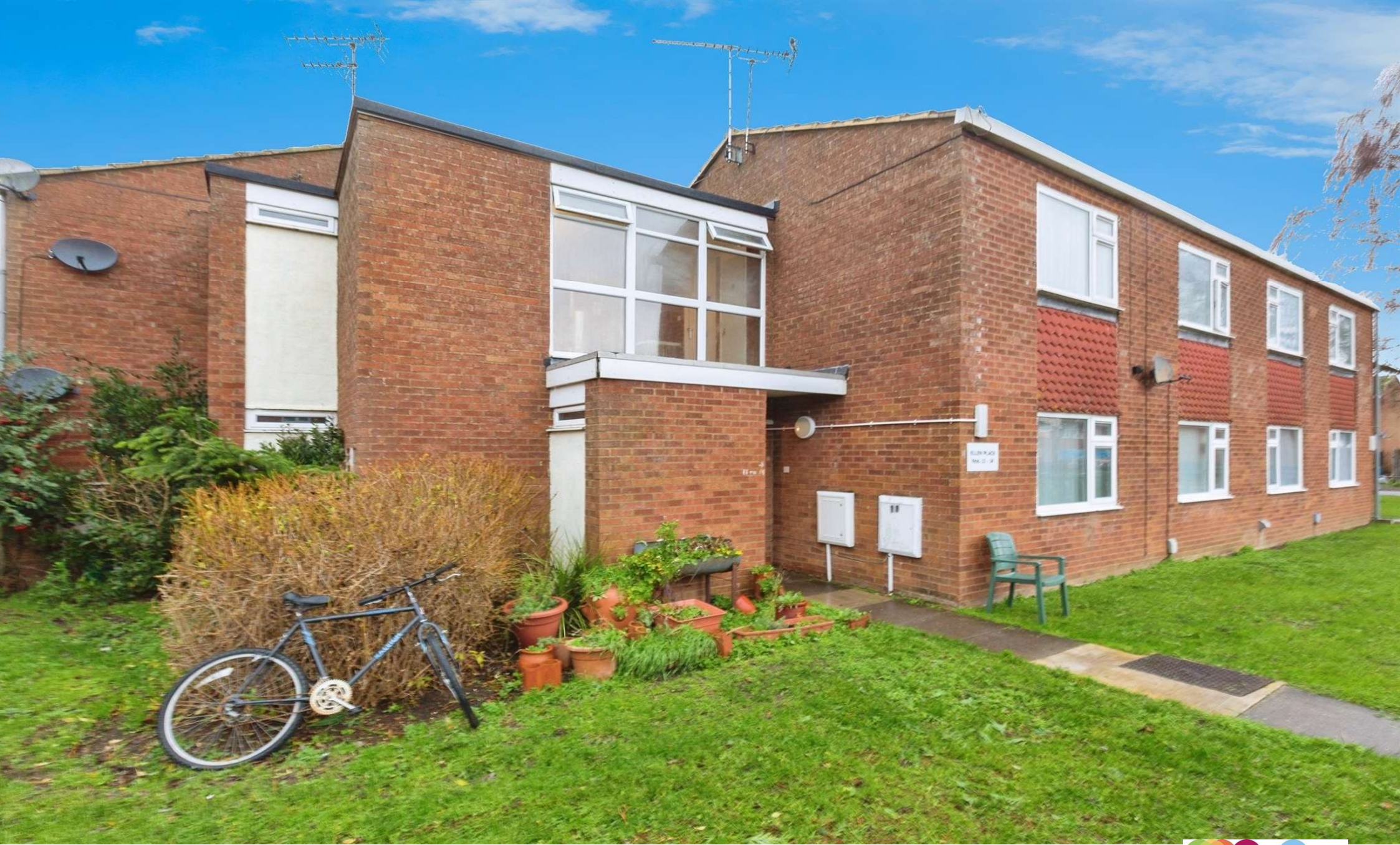
Ellen Place, Aylesbury HP21 8PY