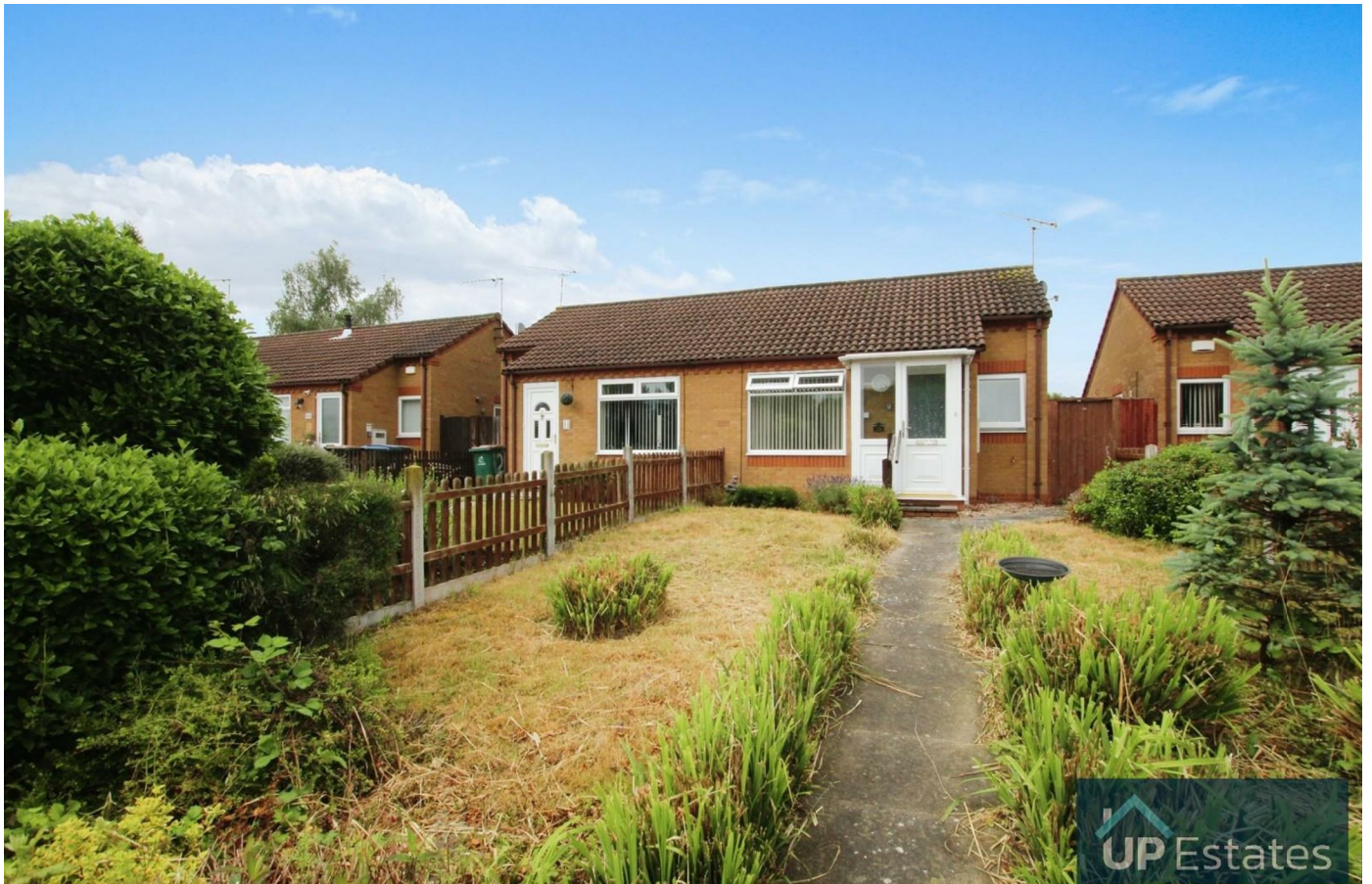
Cheltenham Croft, Coventry