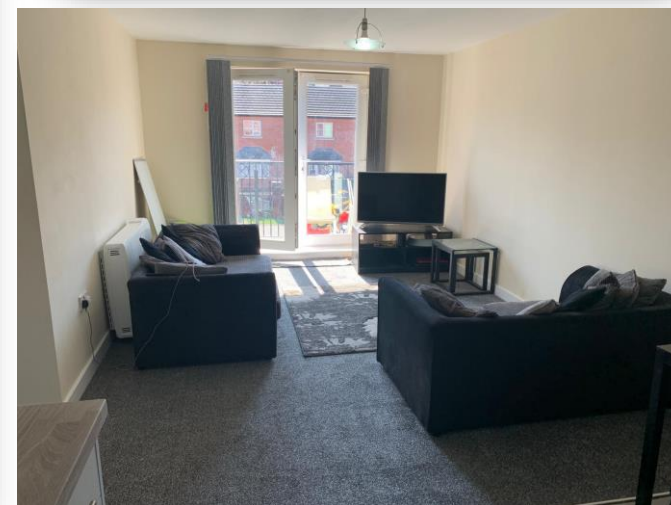
Barleycorn Drive, Birmingham B16 0NA