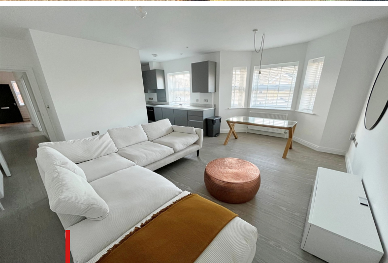
FLAT 3, SUNNYHILL COURT SOUTHBOURNE Dorset, BH6 5AD