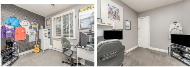
Double glazed window, central heating radiator, a large single bedroom with ample space for bedroom furniture