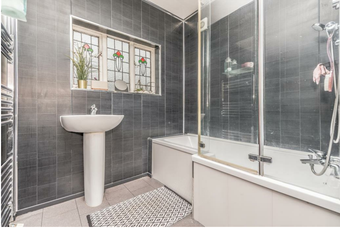
Double glazed window, a white suite comprising of a panelled bath with a plumbed shower above, wash basin, ladder style central heating radiator / towel warmer