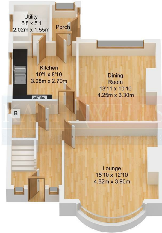
Ground Floor Approx. 56.52 sqm. (608.37 sqft.)