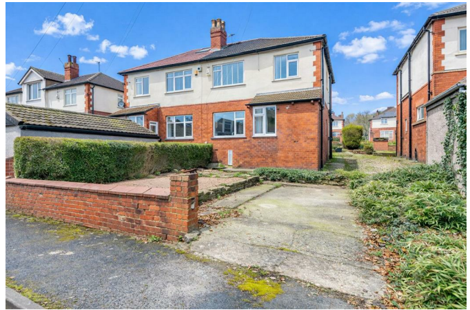
A driveway to the rear of the property provides useful off street parking to the rear of the property provides additional off street parking.