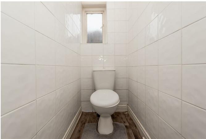
Double glazed window, low flush WC