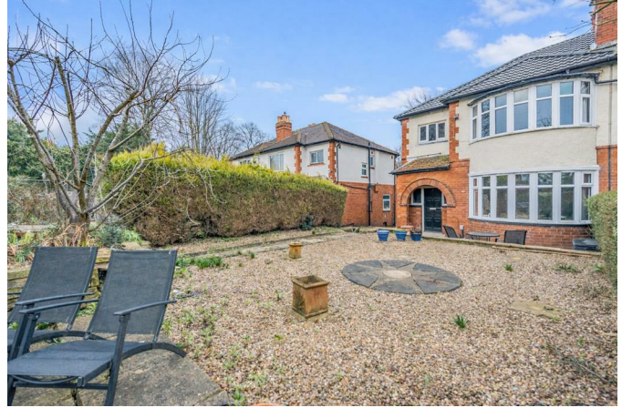
The front garden is fully enclosed and largely low maintenance, the rear garden is also low maintenance and has access to a garage