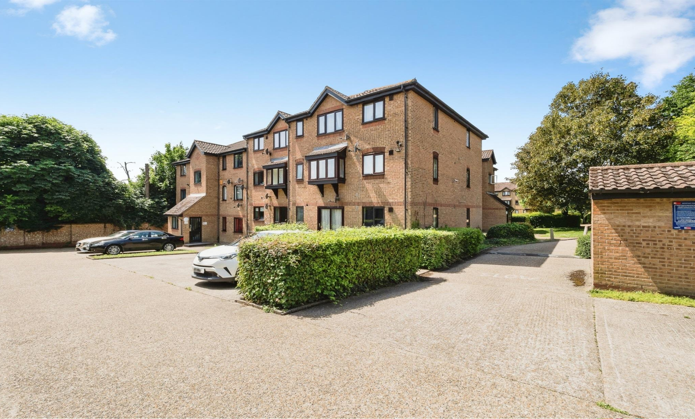
Branstone Court, Linnet Way, Purfleet-On-Thames RM19 1TF