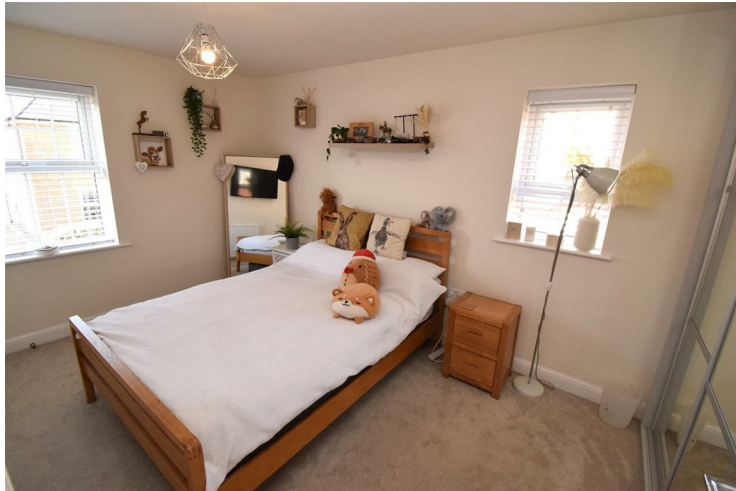
Bedroom 2 12'7" x 9'2" (3.86 x 2.81)

Measurements do not include the wardrobes. Second dual aspect bedroom with double glazed front and side windows. Fitted floor to ceiling wardrobes with mirror sliding doors, a further over stairs storage cupboard and a radiator.