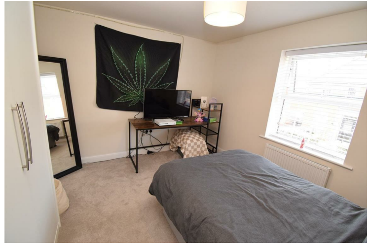
Bedroom 3 11'5" x 10'9" > 8'9" (3.48 x 3.28 > 2.67)

Measurements include the wardrobes. Good size third bedroom with fitted floor to ceiling wardrobes, a radiator and double glazed front window.