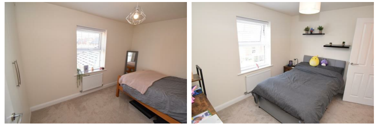
Bedroom 4 11'3" x 8'8" > 6'9" (3.45 x 2.65 > 2.07)

Measurements do not include the wardrobes. Fourth double bedroom with a radiator, fitted floor to ceiling wardrobes and a double glazed window overlooking the garden.