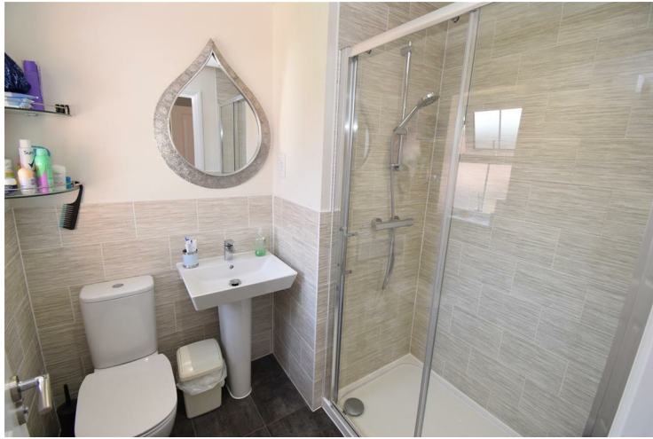
En-Suite Shower Room 6'9" > 4'0" x 5'9" (2.07 > 1.23 x 1.77)

Stylish three piece suite comprising double shower, wash hand basin and WC. Heated towel rail, ceiling spotlights, extractor vent and a double glazed rear window.