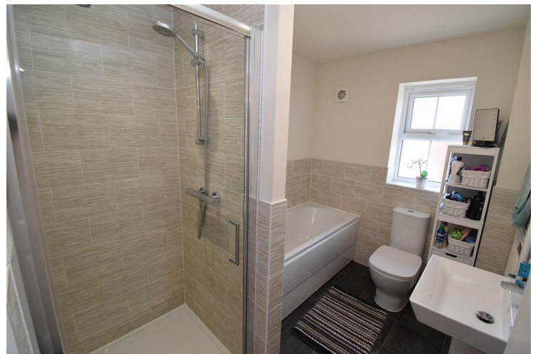
Bath/Shower Room 8'9" x 8'6" (2.67 x 2.60)

Fitted with a luxury four piece suite, comprising bath, separate shower, wash hand basin and WC. Tiled splashbacks, a heated towel rail, extractor vent and a double glazed front window.