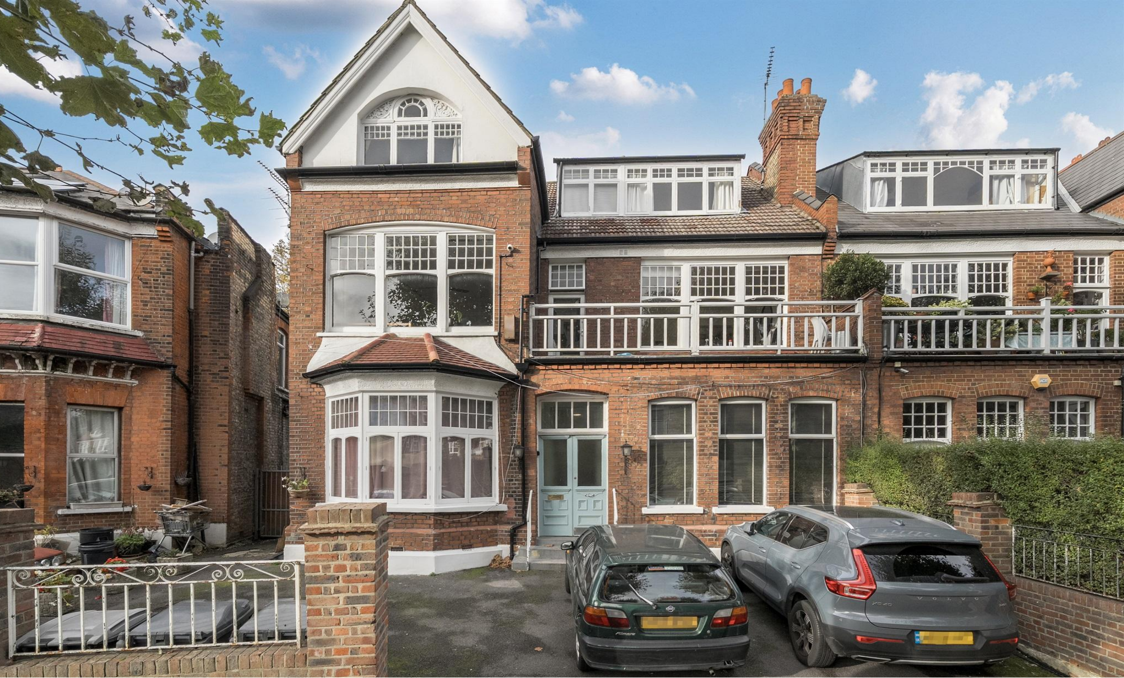
Princes Avenue, Muswell Hill, N10 3LR