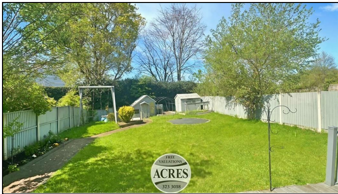
Streather Road, Sutton Coldfield, B75 6RB