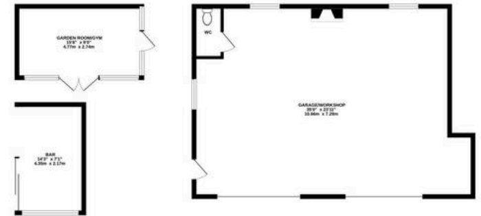
1038 sq.ft. (96.4 sq.m.) approx.