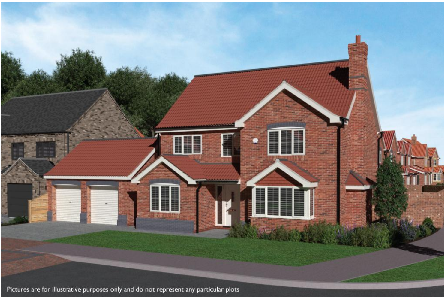
Pictures are for illustrative purposes only and do not represent any particular plots