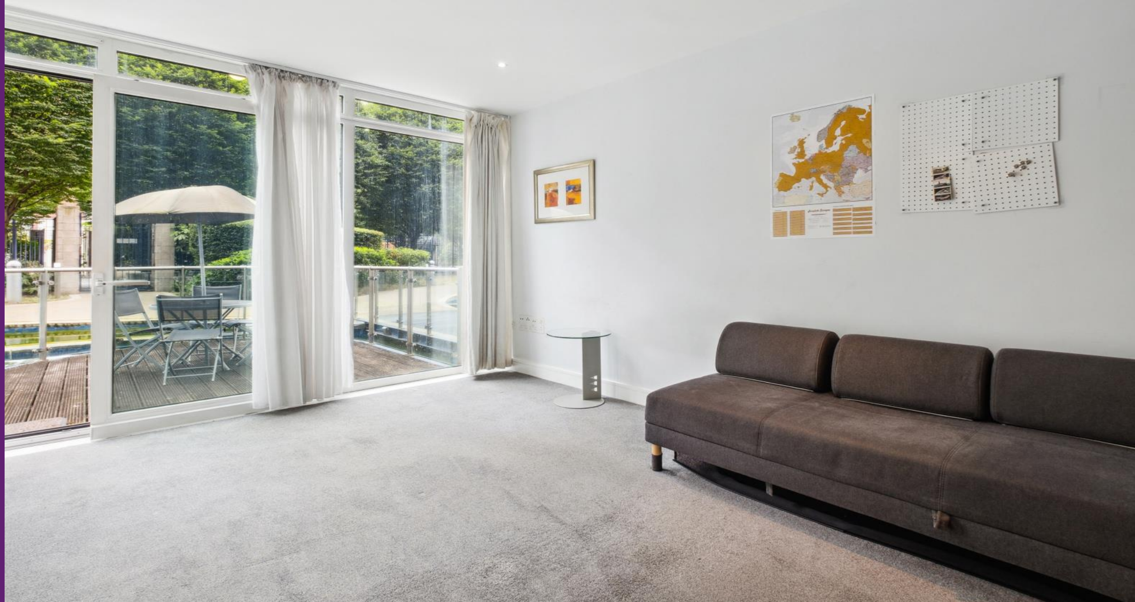
Howard Building 368 Queenstown Road, SW11