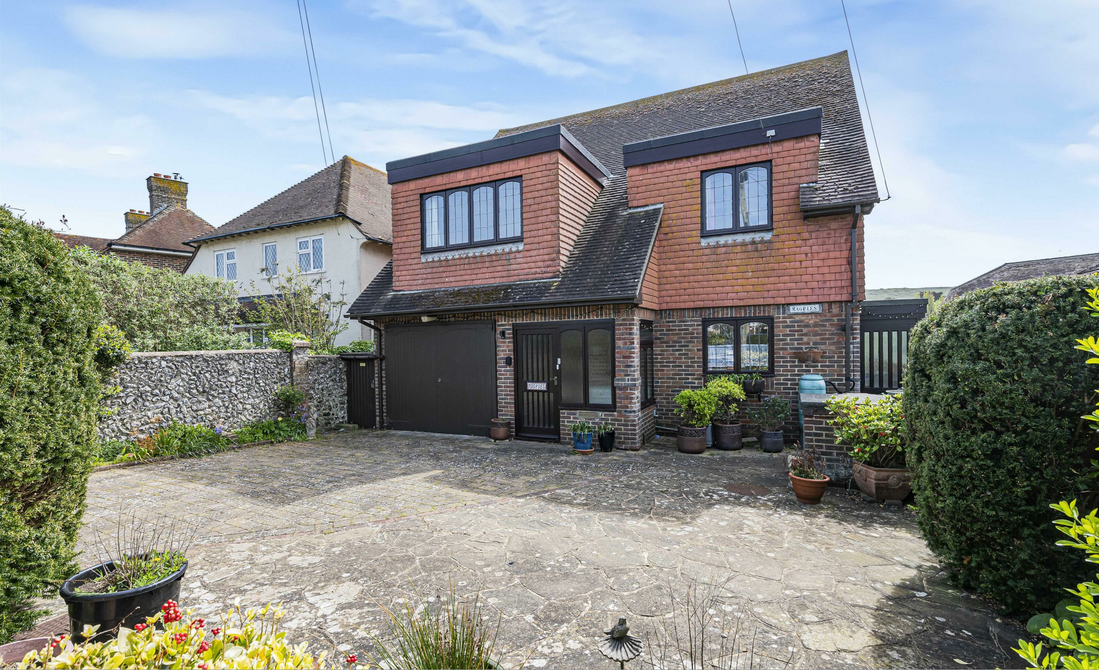
Magpies Rother Road, Seaford, BN25 4HT