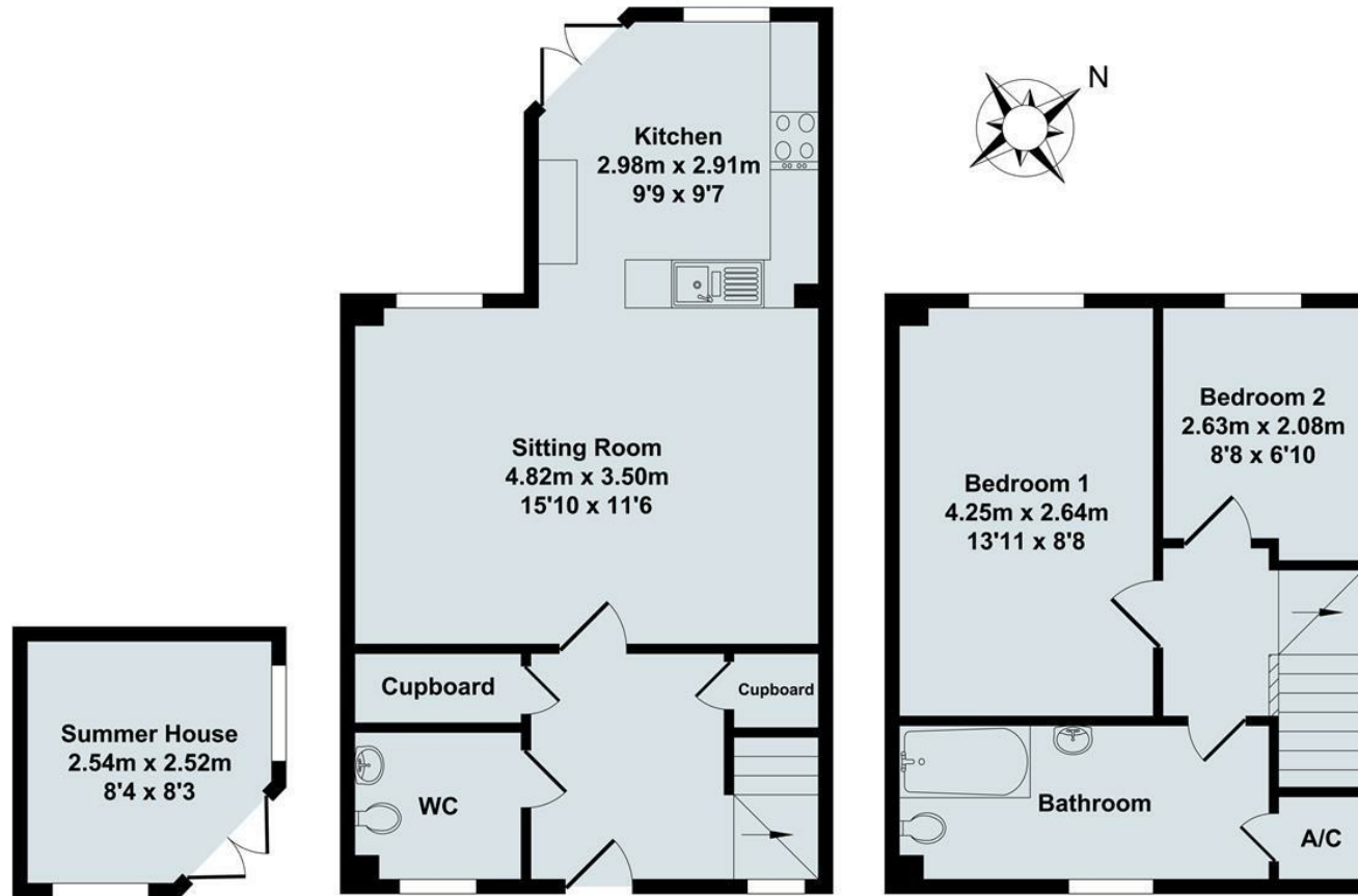
Outbuilding Approx. Floor Area 5.86 Sq.M. (63 Sq.Ft.)