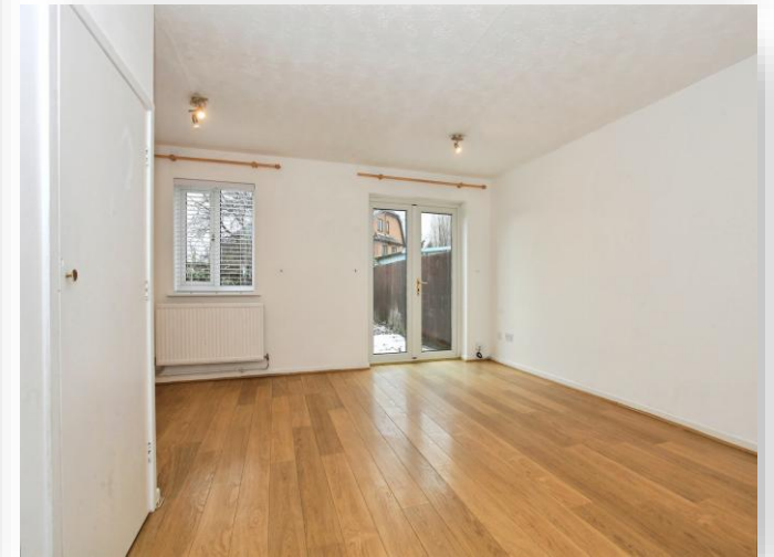
Stagshaw Drive, Peterborough, PE2 8NQ