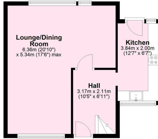
Ground Floor Approx. 42.1 sq. metres (452.7 sq. feet)