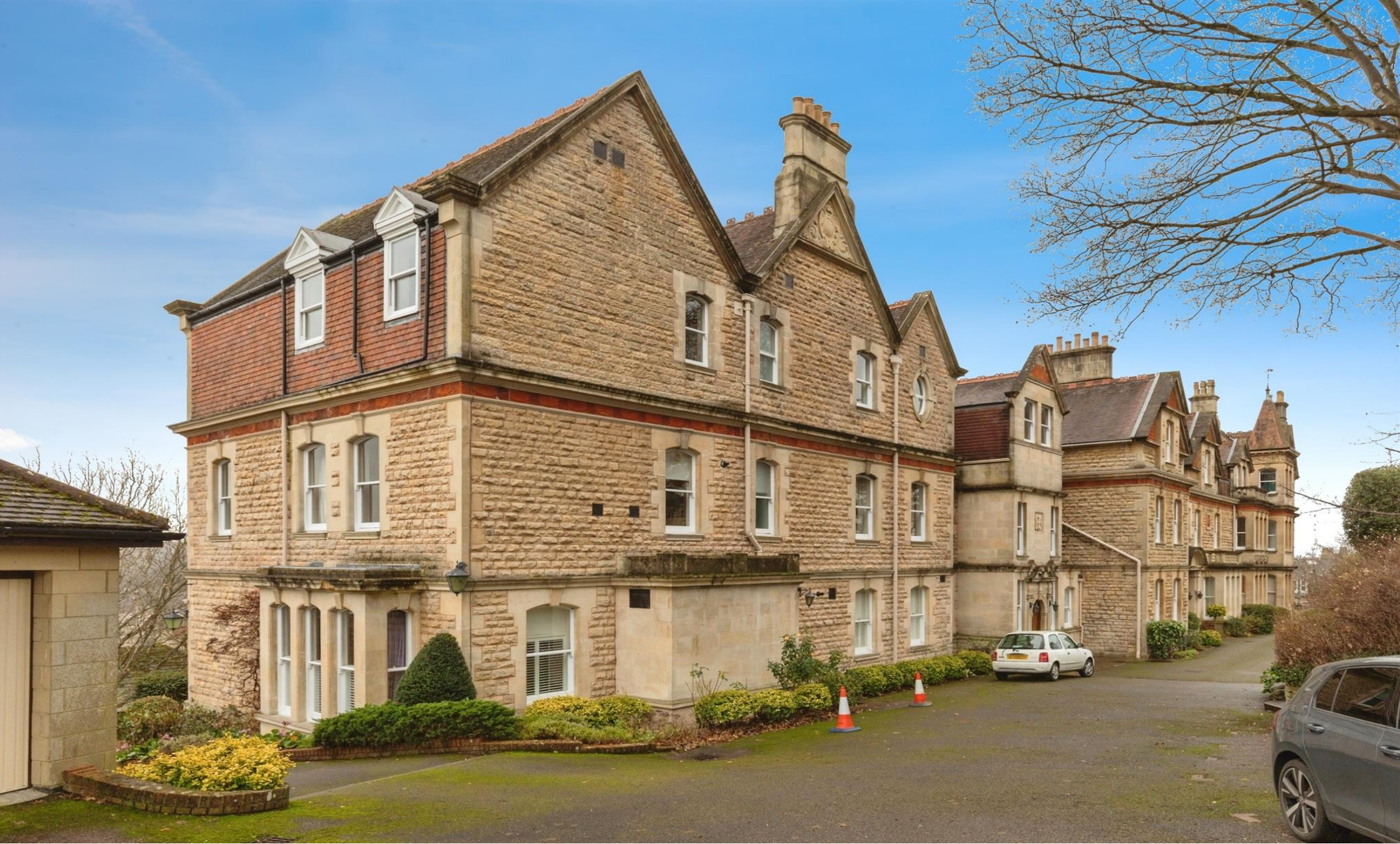
Haygarth Court, Lansdown Grove, Bath, BA1 5EL