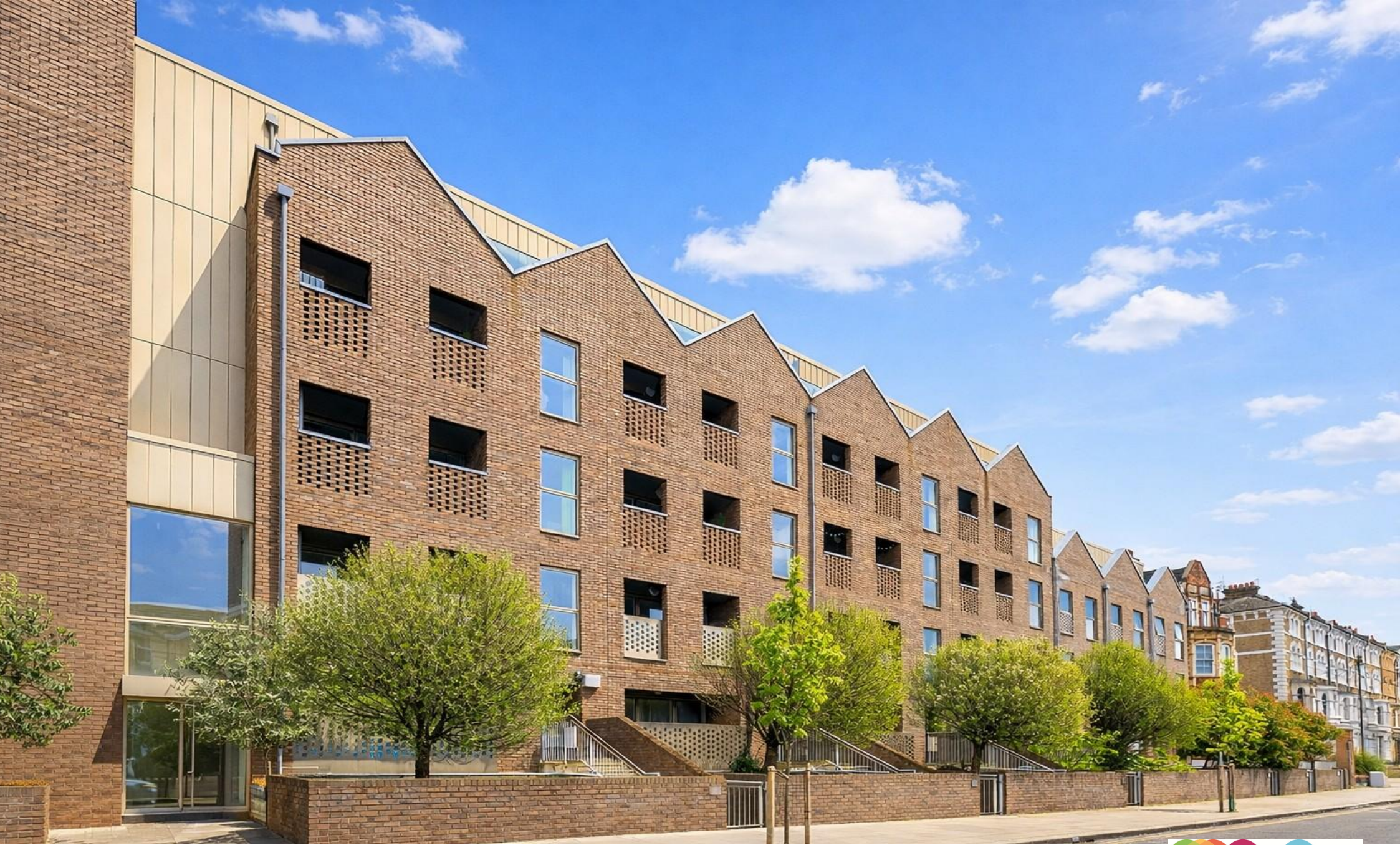
Greenaway Apartments Bedford Road, London SW4 7EF