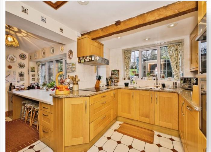
Boleshay, Bishops Lane, Hardington Mandeville Yeovil, BA22 9PJ