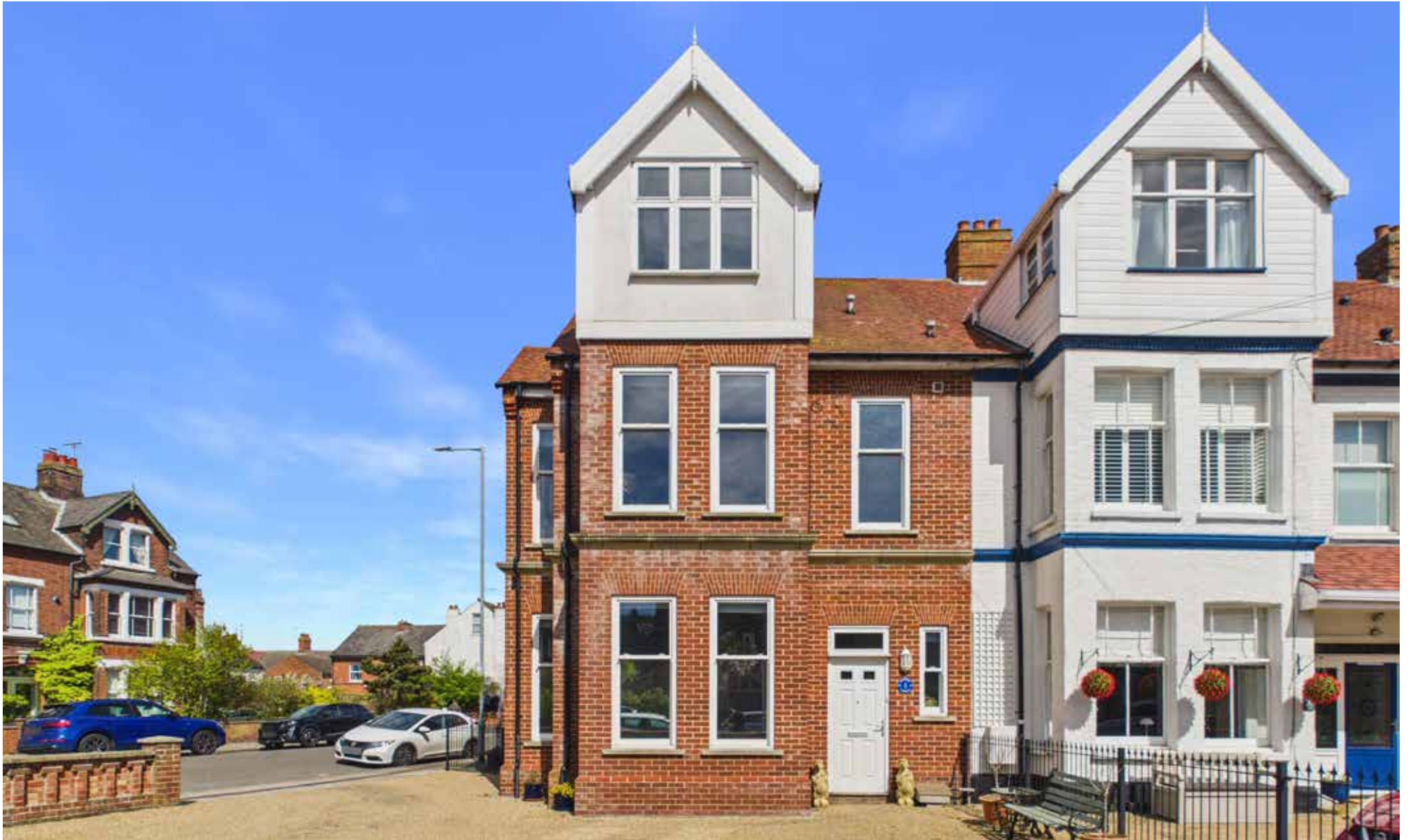
1 Sunrise Terrace Lyndhurst Road | Lowestoft | Suffolk | NR32 4FA