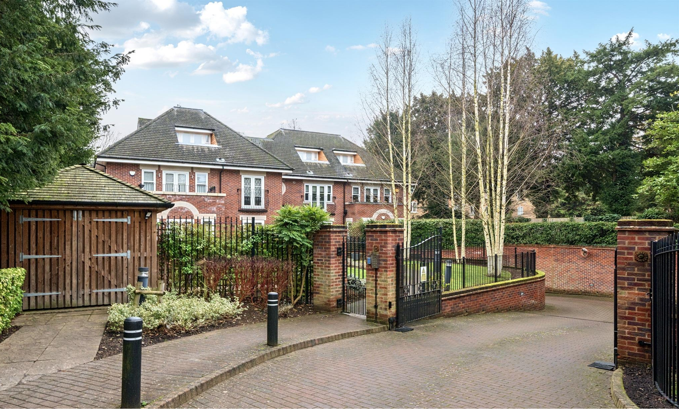
Roseanna Lodge, Village Road, Enfield, EN1 2ET